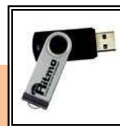
Software Ritmo Transfer